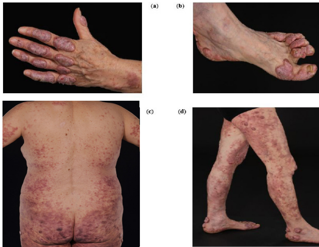
Figure 1: Clinical presentation of the patient before systemic therapy with topical and systemic steroid and intravenous immunoglobulin. Lesions are present on hand and feet. (a) Plaques on the extensor surfaces of the hands and fingers. (b) Large plaques and fibrosing nodules, distributed symmetrically on the extensor surfaces of feet. (c) Erythematous macules on the trunk. (d) Erythematous macules and nodules on the extremities.

cancer (high grade ductal carcinoma-in-situ), intraductal papillary-mucin neoplasia of the pancreas and recurrent pneumonia.