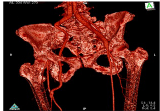
Figure 3: 3D-Angio-CT reconstruction (antero-lateral view) showing the partial resection of the infected right branch of an aorto-bifemoral by-pass graft, and substitution by a new obturator foramen by-pass graft. Take note of the distal anastomosis at distal profunda femoral artery (far from infection) and the transposition of the superficial femoral artery on the distal graft anastomosis.

After having been discussed the pros and cons of the intervention with the patient and her family, we decided to perform a resection of the affected graft and a substitution by a new trans-obturator by-pass (Figure 3 and 4).