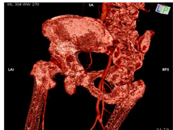
Figure 4: 3D-Angio-CT reconstruction (postero-lateral view) perfectly showing the graft crossing the obturator foramen.

The sterile part of the operation was achieved first. The infected groin was sealed off with an occlusive drape. Through an incision made in the middle third of the anterior aspect of the thigh, the distal PFA and middle portion of the SFA was controlled, far enough away from the infected zone. After this, a retroperitoneal access by means a transverse abdominal incision was made with a safety distance away from the groin. The peritoneum and its contents were retracted medially, along with the ureter and the pelvic organs. The previous graft was dissected until a firm incorporation of the same in the surrounding tissues was reached, indicating that the proximal part of the graft could be preserved. The right branch of the graft was then transected, closed and pushed down towards the inguinal ligament. The obturator foramen was identified easily by digital palpation on the anterior-medial aspect of the foramen. A tunnel was made trying to connect both incisions, passing the tunneling instrument upwards. We led the tunneler through the foramen bimanually, palpating where the tip of the tunneler was