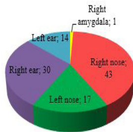
Figure 1: Patients distribution according to foreign bodies' site.

The children's mean age was 4.2 years. There was no difference between male (50.5%) and female (49.5%) sex. As shown in Figure 1, 57.2% of the cases were nasal cavities' FB, being 41% in the right cavity and 16.2% in the left one, and 41.9% were ears' FB, being 28.6% in the right ear and 13.3% in the left one. Only one case (1%) was of right tonsil's foreign body.