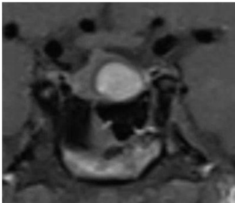
Figure 1: At diagnosis, coronal T1-weighted image showed a 1 cm hyperintense pituitary tumor.

A 17 years-old patient was referred to our institution for suspicion of delayed puberty. He had no medical history. Phallus was 7 cm length and testis volume was 10 mL. Secondary sexual characteristics were scarce. He had no growth retardation. Testosterone level was 23 ng/dL (normal 32-140) with low gonadotrophins (LH: 4.8 UI/L, FSH: 2.6 UI/L). Prolactin level was 40 ng/mL (normal 3.4-19). Cortisol, TSH, T4I, IGF-1 were in the normal range. MRI revealed a 1 cm pituitary cystic macro adenoma (Figure 1), leading to the diagnosis of cystic macroprolactinoma. Visual fields were normal. NEM1 and AIP genes were negative. The patient was treated with dopamine agonist cabergoline 0.5 mg twice a week. The treatment was poorly tolerated and the cabergoline was thus switched for quinagolide 75 microgram/day. 3 months later prolactin level was 9 ng/ml and testosterone reached 70 ng/dL. Secondary sexual characteristics progressively developed. MRI was periodically controlled and 2 years later (Figure 2), the pituitary mass had totally shrunk mimicking surgical excision.