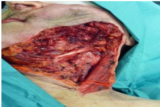
Figure 3: Appearance after wide dissection.

After partial endoscopic embolization, the patient underwent wide excision with clear margins extending to the internal mucosa of the mouth and the homolateral cervical lymph nodes (level Ib and II) (Figure 3).