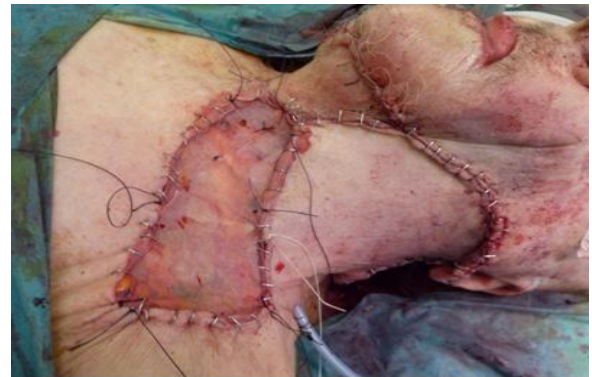
Figure 4: Reconstruction of the defect with local flap and skin graft.

Reconstruction was performed with a Bakamjian deltopectoral flap and a split-thickness skin graft (Figure-4).