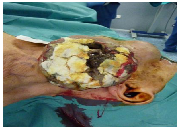
Figure 1: Clinical presentation of the tumour.

vere problem for her and her family, impeding opening her mouth and chewing.