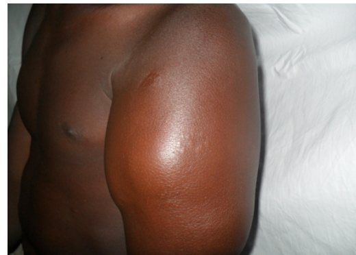
Figure 1: Soft tissue swelling in the left shoulder with severe tenderness.

neurological deficit. The weight loss was 3 kg.