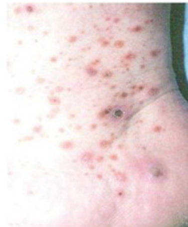
Figure 1: Skin lesions of the lower limb.

A 57 years old female patient with known HCV infection - diagnosed 5 years ago and non-responder at that time to pegylated interferon and ribavirin regimen - was admitted through the emergency unit into our Department of Nephrology. She presented with the following clinical features: peripheral oedema, purpuric lesions located merely on the lower limbs, shortness of breath, severe arterial hypertension (Figure 1). The laboratory examinations showed: hematuria and proteinuria associated with a progressive decrease of eGFR, cholestasis and hypoproteinemia; eGFR was calculated using Chronic Kidney Disease- Epidemiology Collaboration (CKD-EPI) 2009 equation (Table 1). The immunological tests revealed: C4 component of the complement severely decreased (suggestive for cryoglobulinemia), rheumatoid factor highly increased and positive cryoglobulins. We established the diagnosis of rapidly progressive glomerulonephritis and severe secondary arterial hypertension, in a patient with known history of HCV infection.