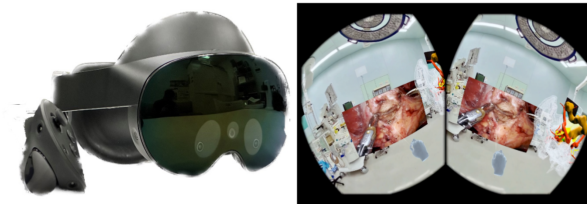
Figure 4: Meta Quest Pro's Color Pass-Through Function incorporates real-time color correction, layer-based editing, and a transparent effect. 4a: Meta Quest Pro's stereo cameras for path-through. 4b: Augmenting the stereo-3D immersion of real-world experiences.