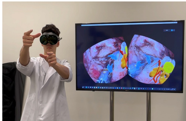
Figure 3: RARP training with multimodal image support.

VR environment to guide the dissection and procedure process. Specifically, structural and spatial recognition of pelvic organs and understanding of the RARP surgical procedure was facilitated (Figure 3). In addition, the stereoscopic endoscopic images and polygonal data could be freely enlarged and positioned within the VR space using hand gestures, providing a realistic sensation of being at the tip of the endoscopic scope. Furthermore, the background within the VR-HMD could be changed between virtual space and pass-through (Figure 4). In the pass-through state, stereoscopic images and 3D polygons were displayed in front of the eyes in real space, providing a realistic training experience. In addition, hand gestures using the infrared sensor of the VR-HMD allowed the user to grasp the 3D model with his or her own hands, providing real-time interactivity.