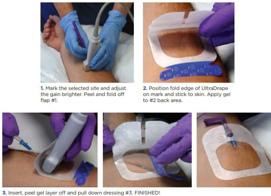
Figure 1: The 1-2-3 procedure for applying the sterile transparent barrier and securement dressing for probe protection.

Data were collected over five weeks, from April to May 2019, using a validated Likert study tool on the Survey Monkey website (Momentive Inc., One Curiosity Way, San Mateo, CA 94403, USA). The study tool was validated through a five-clinician feedback review performed at a Northeastern medical center. Data included facility location, the type of catheter device inserted for each procedure, and tool completion by the clinicians for each question listed in the tool. No personal medical information was collected for the patients in the UGPIV insertion procedures. Data from the clinician feedback was stored in a secure database and maintained for the required years.