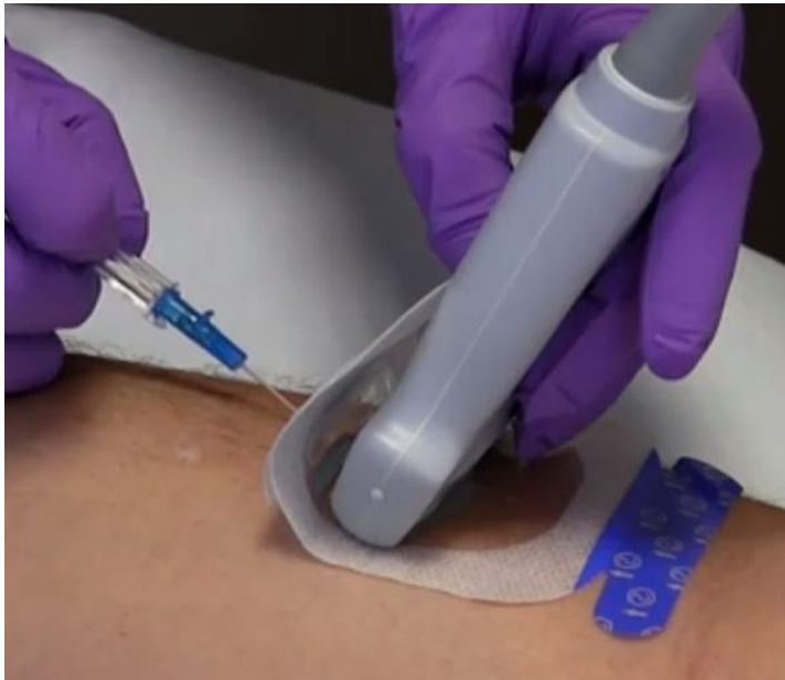
Figure 3: Representative photo illustrating UGPIV catheter insertion with sterile transparent barrier and securement dressing.

The final analysis of probe protection using the transparent barrier dressing versus the sterile probe sheath cover reported a preference for the transparent barrier dressing at 97.5% and a recommendation for the adoption of this standardized procedure and probe protection at 99.5%.