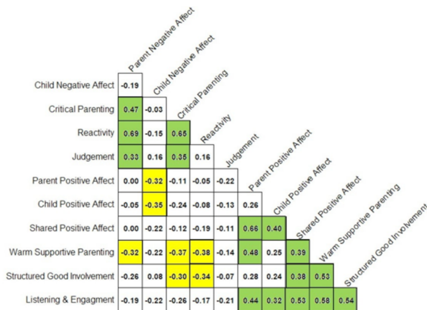
Figure 3: Spearman correlation matrix of significance for parenting behaviors. Green indicates positive significant correlation ( p < 0.05 ) and yellow indicates negative significant correlation ( p < 0.05 ).

Many, although not all, positive parenting subscales were correlated to each other. Most notably, listening & engagement was associated with all positive parenting subscales ( r 's 0.32- 0.54, p 's < 0.05). Parent negative affect was significantly positively associated with all negative parenting subscales ( r 's 0.33-0.69, p 's < 0.05). In addition, as shown in Figure 3, some positive and negative subscales negatively correlated with one another. For instance, while child negative affect did not correlate with negative parenting subscales, it did negatively correlate with both positive parent and child affect ( r 's -0.32 and -0.35, respectively) (all significant correlations shown in (Figure 3)).