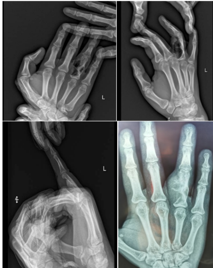
Figure 1: X-ray of the left hand, a radiolucent image with a nodular appearance in the phalanx of the 4 th finger.

degrees. The study protocol began requesting radiography, USG Doppler, and magnetic resonance imaging of the left hand, as well as preoperative laboratories. In the X-ray of the left hand, in the palmar region of the proximal phalanx of the 4th finger, a radiolucent image with a nodular appearance, with irregular edges, which causes irregularity in the bone cortex, with areas of thinning and deformity due to bone destruction, showing a predominance of affection in its volar aspect. As a final statement, a lytic and expansive tumour is reported in the proximal phalanx of the fourth finger (Figure 1).