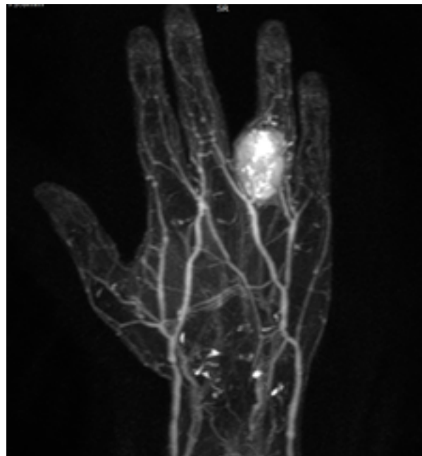
Figure 4: angiography sequence, dependent irrigation of the digital artery of the fourth finger is observed. conclusion to be considered a giant cell tumour of the tendon sheaths vs. hemangioma.

Due to clinical progression, surgical management was decided. Planned surgery: en bloc resection of the tumour with bone reconstruction with cadaveric bone graft plus deep flexor tenorrhaphy. The procedure is performed under mixed anaesthesia with balanced regional + general block, asepsis and antisepsis with chlorhexidine, and the ischemia time begins. Tumour resection is performed with monopolar energy. There is no evidence of injury to the tendon sheath, the capsule is intact, and it is resected en bloc without eventualities. Bone scarification is performed, edge regularization and bone tissue is filled with surgical cement. Hemostasis is verified. The A2 pulley is rebuilt and repaired. Finally, flaps are made for skin closure. The surgery lasted 120 minutes, with 90 minutes of ischemia. 50cc bleeding. A transoperative study was carried out where a tumor of the peripheral nerve sheath was reported. Subsequently, a definitive